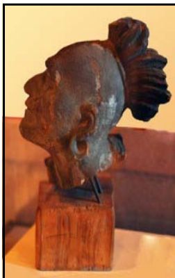
Squanto Bust

At http://www.plimoth.org we find the following account by the Wampanoags, "Around 1,000 years ago, the elders tell us, our relative the Crow flew from the Southwest to the Wampanoag Nation, bringing us the first corn and bean seeds (weachamin gka tuppquam wskan-nemuneash) as a gift from the Creator. Since that time we have learned from our grandmothers and grandfathers how to sow, tend and harvest these wonderful plants."