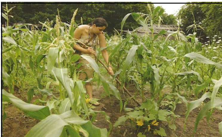
A Wampanoag cornfield with a Wetu (house) at the back at Plimoth Plantation. Beans and squashes are also planted with the corn and the three are called "Three Sisters."