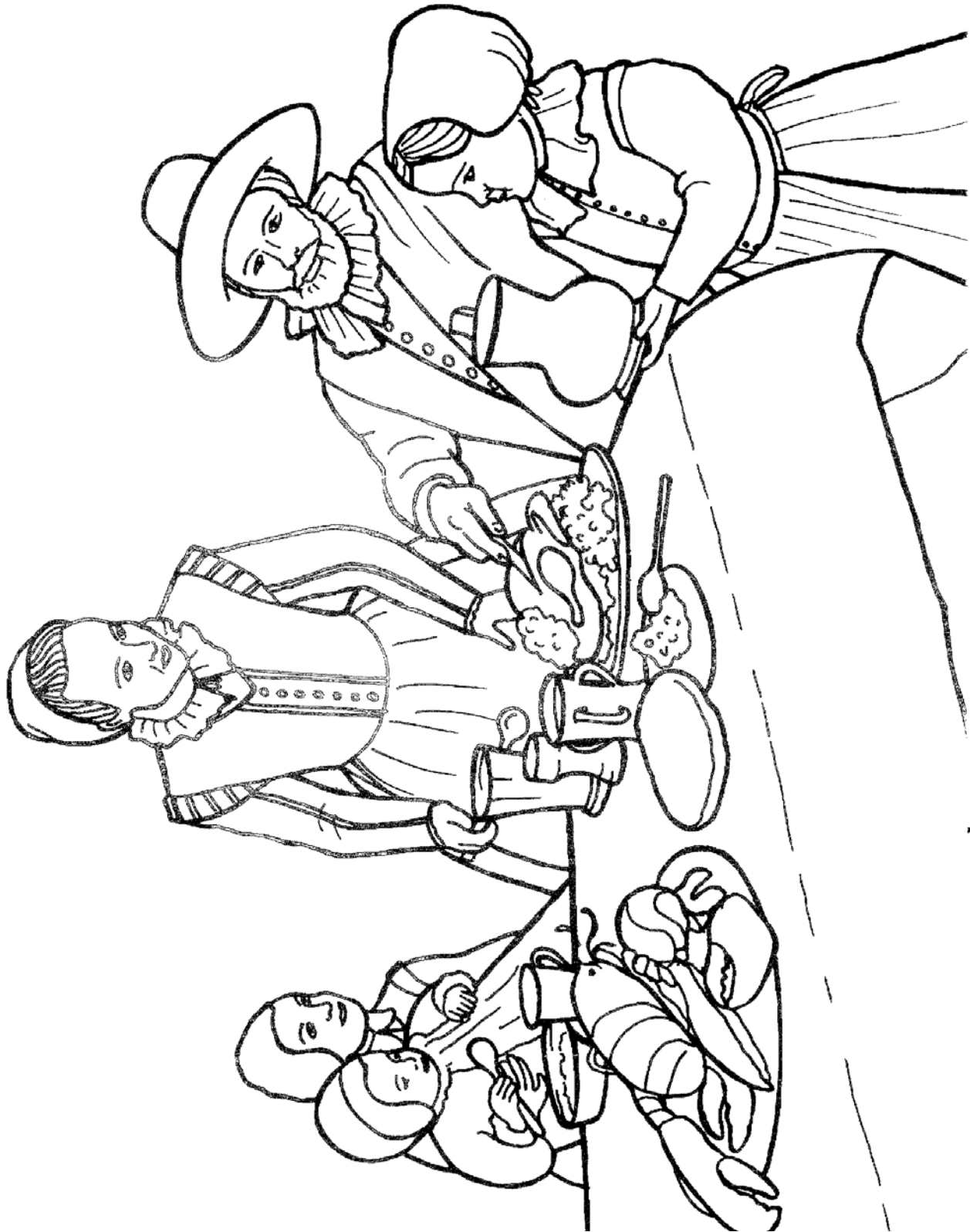
From Plymouth Plantation Coloring Book Drawings by Die Modlin Hoxie. Courtesy of Plymouth Plantation.

Write the name of your Pilgrim "father" and "mother" above their heads. Which child is the one from whom you descend? Write her or his name too.